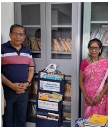
At Matushree Vridhashram Bhiwandi

This project reflects our ongoing dedication to uplifting lives and serving with compassion, one thoughtful gesture at a time.