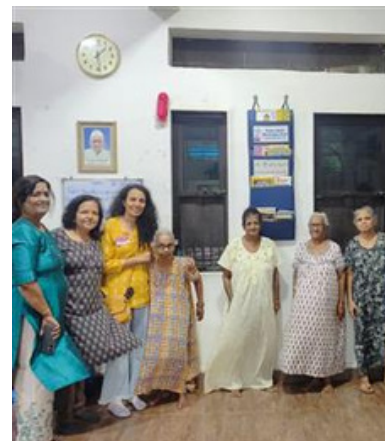
At Karuneshwar Old Age Home , Panvel