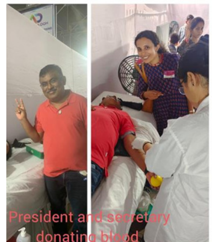
President and secretary donating blood