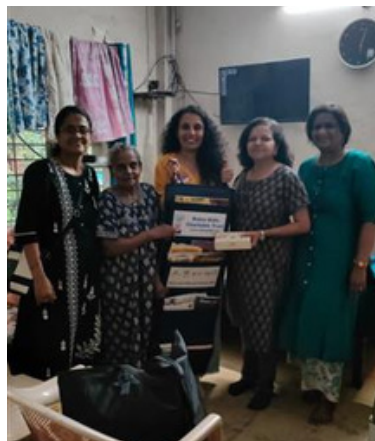
At Aadharwad Old Age Home, Koparkhairane